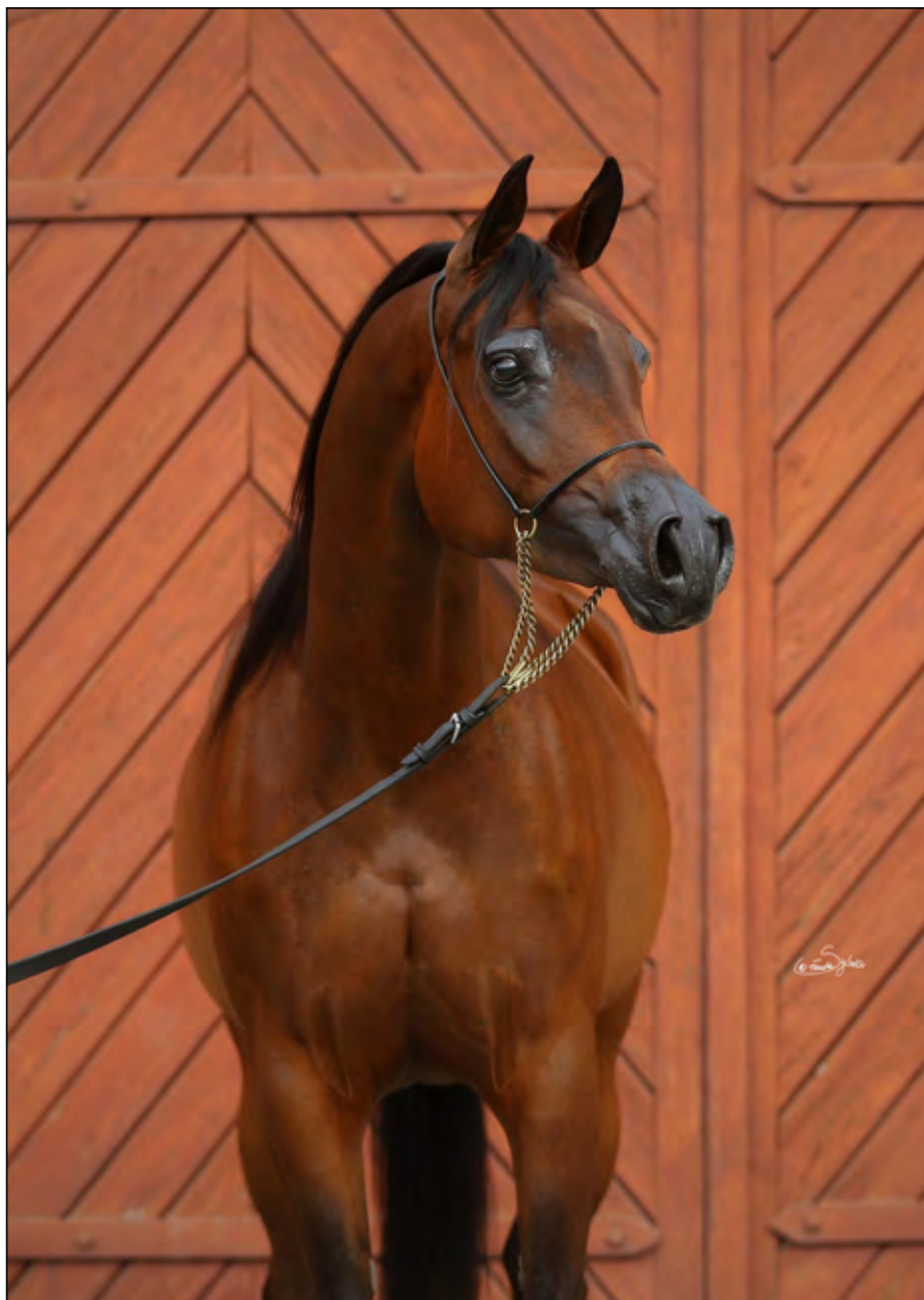
Forga (Morion x Forgissima)

in 2017 at Al Thumama and Daniya AT (out of Donya Jamal/Nader Al Jamal) was 2019 Silver Champion Yearling Filly at the Arabian Horse Weekend, Int C-show in St Oedenrode.