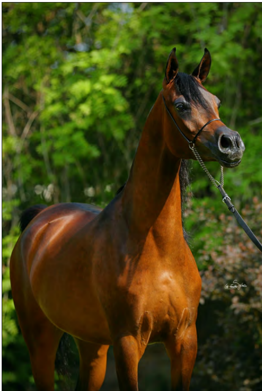
Forga (Morion x Fogeza)

Gold Champion and Polish National Bronze Yearling Champion, El Mariella (out of El Marina/Ganges) 2021 Białka Spring Show Yearling Gold Champion and El Medida was Białka Spring Show Gold Junior Champion and Classwinner at the Menton show .