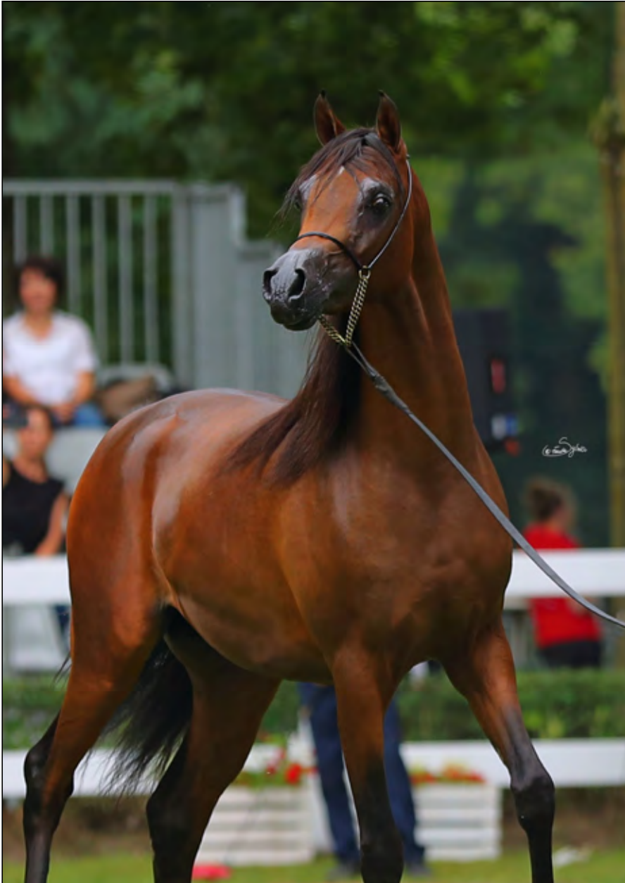
El Brillo (Morion x El Larinera)

Champion! Białka Spring Show Yearling Gold Champion, Polish National Yearling Gold Champion and Best in Show and European Yearling Gold Champion. As a 2-year old Ferrum repeated the result and won Białka Spring Show Gold Champion, Polish National Junior Gold Champion, in the fall he was shown in Verona and was named European Junior Silver Champion. Ferrum is the best stallion born in Polish State Studs in the last decade with an impressive show record. He was offered for sale at this years Pride of Poland auction