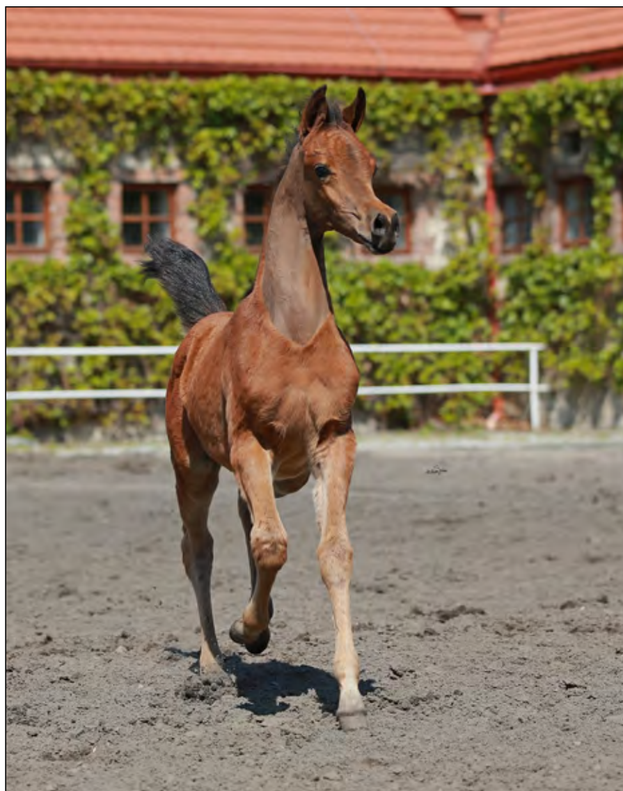
Emiremia (Morion x Emblema)

Morion have despite his young age already put his mark in the history not only through wonderful daughters but he has also a string of sons of very high quality. Morion belongs to a very strong sire line, but the strength and stamina in Morion and his offspring comes from the greatness of Mitra and the dam family of Gazella db, a family known not only for their beauty but even more for the stamina and big heart and the ability to perform. ○